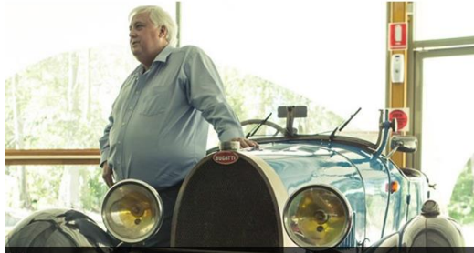
Clive with the 40A

If you are thinking of making a visit to Clive Palmer's Coolum Resort Motorama Collection, which includes two Bugattis (57580, & a 40A) amongst over 100 cars, don't bother as Motorama closed on the 16 March for planned renovations/repairs. Motorama will be re-opened at a future date.