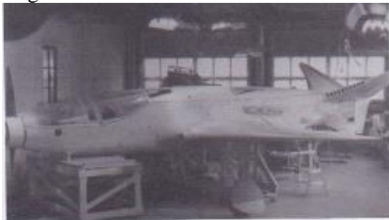
Photo of the original 100P as built in 1939.